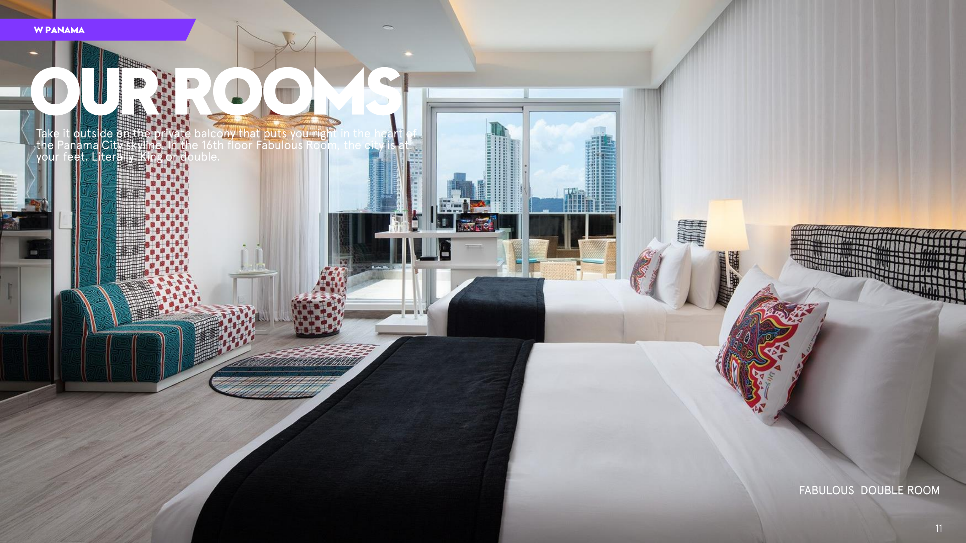
FABULOUS DOUBLE ROOM

Take it outside on the private balcony that puts you right in the heart of the Panama City skyline. In the 16th floor Fabulous Room, the city is at your feet. Literally. King or double.