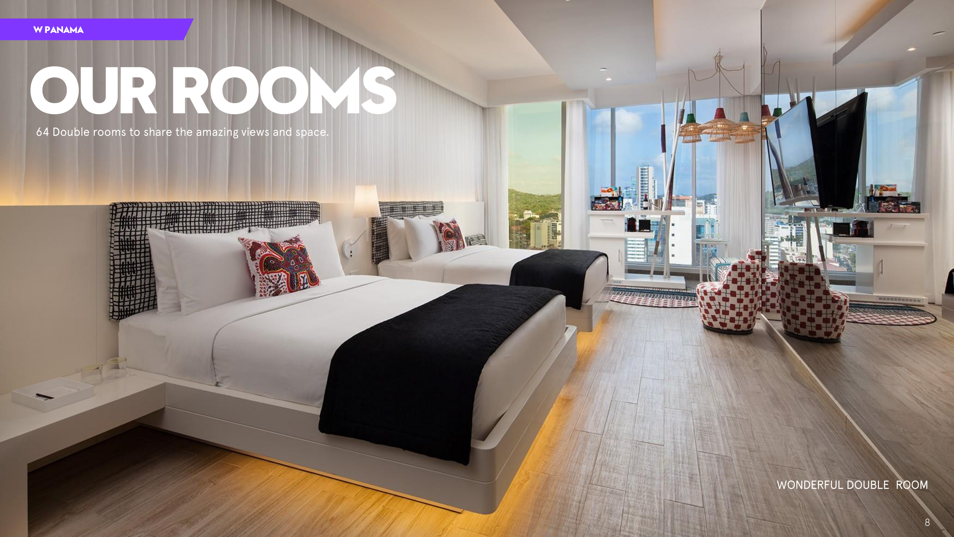
WONDERFUL DOUBLE ROOM

64 Double rooms to share the amazing views and space.